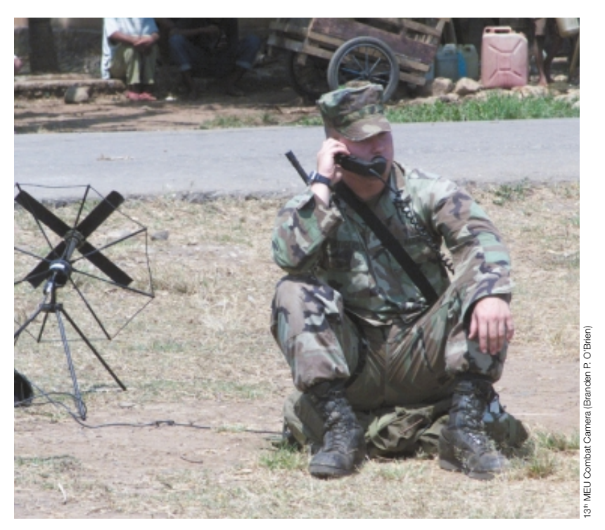
Communicating with USS Tarawa, East Timor.

increasing importance of achieving information dominance, the role of space has become prominent. As the Secretary of Defense has reported: