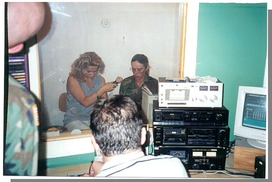
Figure 11. US PSYOP Funded Radio Station

KFOR and MNB-E both funded radio stations (see figure 11) and KFOR TV programming as well. Airtime was purchased by KFOR for RTK TV broadcasts in Pristina. Popular music and KFOR message scripts were provided to radio stations for broadcasting and weekly commander talk shows were employed to get the KFOR message on the airwaves and discuss local issues and initiatives. Where telephone service existed, people could call in to talk to the commander while on the air. In MNB-E, the Medical Civil Action Program (MEDCAP) also played an important role in support of the information campaign in addition to its primary role of providing medical services. Several times a week MEDCAP units (see figure 12) would visit different remote communities to provide immediate medical care to persons suffering from minor conditions. The MASH style tent hospital on Camp Bondsteel in MNB-E provided