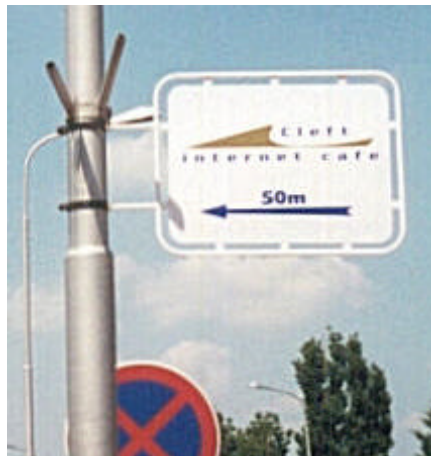
Figure 8. Sign to Internet Café in Pristina

Internet became a major player for informing and facilitating information sharing among the various parties. Extensive use was made of Internet web sites for open information