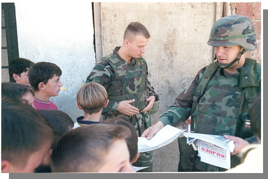
Figure 10. US PSYOP Soldiers

UNMIK, OSCE, KFOR and MNB approaches and products included use of newspapers (including inserts for local papers), magazines, posters, handbills, radio/TV, press conferences and releases, and Internet web sites. UNMIK published the “UNMIK News,” OSCE the “UPDATE,” UNHCR the “Humanitarian News,” KFOR the “KFOR Chronicle,” and at the MNB level the US for example produced the “K-Forum” and “Falcon Flier.” Paid inserts for local newspapers (mainly, Albanian since there was no Serb press in country) were employed by KFOR and MNB-E (the US Task Force Falcon PSYOP team responsibility). KFOR produced a monthly magazine the “Dialogue.” Posters and handbills were used extensively by KFOR and the MNB PSYOP teams (see figure 10) for focused activities such as mine and UXO awareness, stop the violence, and safe and secure environment.