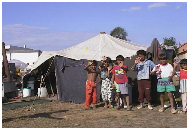
Figure 2. Over 800,000 Kosovo Refugees

Political groupings led by charismatic leader’s play on minority fears and ancient grievances. There are no clear front lines and rear areas but instead fluid “zones of