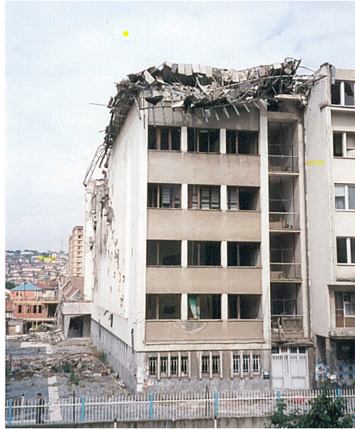
Figure 7. PTK Building in Pristina

Cruse Missile attack that destroyed the telecommunications center (see figure 7) across the street from the facilities now being used for UNMIK headquarters. The UN, KFOR and military voice networks were not interconnected to the degree they were in Bosnia. In many cases, it became necessary to meet face to face in order to communicate and exchange information.