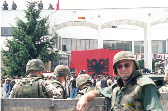
Figure 4. Author with Civil Affairs in Vitina

is not generally the case for the other sectors and the rest of the international military and NATO headquarters elements supporting operations in the Balkans (see figure 5).