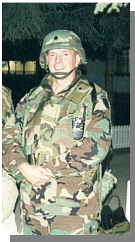
Figure 9. US Civil Affairs Officer with “TalkAbout”

There were new creative uses of commercial products that emerged in Kosovo. In the US sector, the Motorola “TalkAbout” recreational Two-Way radio was used extensively for dismounted, convoy, and base area communications purposes. It became a de facto status symbol and nearly everyone had one clipped to his or her flack vest (see figure 9). There were also other types of commercially available hand held radios that were used by the NGOs, UNMIK, and KFOR personnel. Use of these unprotected radios introduced military OPSEC risks that needed to be carefully managed.