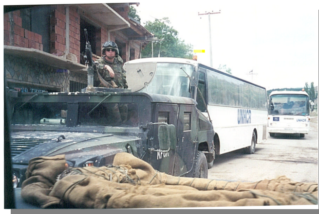
Figure 3. KFOR Escorting Serbs in UNHCR Buses

Understanding the relationships and motivators of the actors on the peace operations battlefield requires an understanding of the complex dynamics at work. The emerging need for stronger civil-military relationships and cooperation are influenced not only by the political context and conditions of the operations but also by the shared moments of the participants on the ground. The decision to intervene in a conflict is political and the military mission in support of the intervention reflects the political process. Military support to such operations is just that, a military operation. The military are there to create a safe and secure environment. For example, in Kosovo, KFOR soldiers guarded Serb enclaves and Churches and escorted (see Figure 3) those Serbs wishing to leave the enclave to travel to Serbia or else where for shopping and medical treatment.