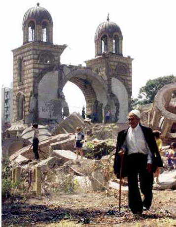
Figure 1. Kosovo Church Bombing

Many conflicts are now driven by the weakness of states rather than their strengths. Wars no longer take place between states that feel strong enough to conquer another but rather within states that have become so weak they implode. “Wars of the Amateurs” occur where the state breaks down and the population regroups into identifiable factions. Disintegration of public law enforcement, the military and other security forces occur as well. The armed amateurs use the full range of conventional weapons for unconventional operations such as “scorched earth” actions, “ethnic cleansing” and terrorism and intimidation (see figures 1 and 2).