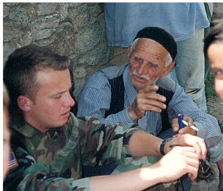
Figure 6. PSYOP Local Hire Albanian Interpreter

Language continues to be a major problem for the military. Operations tend to occur in areas where the military language training programs do not provide an adequate supply of qualified linguists for the area of operation. In the Balkans the interpreters (see figure 6) were a mix of US citizens and local hires. Many of the US citizens had clearances and were used for sensitive military operations such as being attached to Special Forces teams. Although the military intent was to win the hearts and minds, combatant's often used fear and intimidation to inhibit or discourage local inhabitants to openly work with