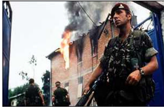
Figure 5. Non-US KFOR Soldier

During Operation Allied Force, allied air operations were conducted above 30,000 feet to keep aircraft, pilots and crew out of harms way. Some argue that this in turn affected the accuracy of the bombing campaign. In spite of the height from which the bombs were dropped, nobody should expect 100% accuracy. Furthermore, although referred to as the first video war, this was not a video game. It was war.