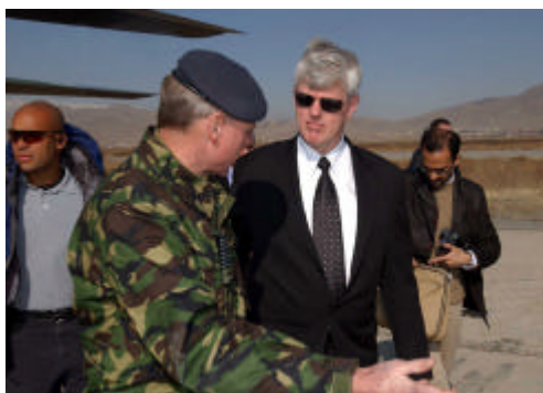
The Canadian Deputy Prime Minister arrives at Kabul Airport

"Canada is part of an unprecedented coalition of nations that has come together to fight the threat of terrorism...I have made it clear from the very beginning that Canada would be part of this coalition every step of the way...all Canadians understand what is being asked of the men and women of our Armed Forces and their families." Canadian Prime Minister, Jean Chretien , 8 Oct 2001