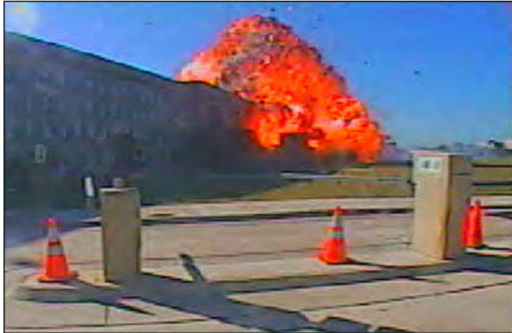
Citizens of dozens of countries died in the attacks on New York, Washington and Pennsylvania