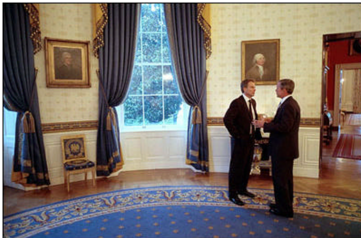
A few hours before addressing the US Congress and the world, President Bush talks privately with British Prime Minister Tony Blair in the Blue Room at the White House Sept. 20.