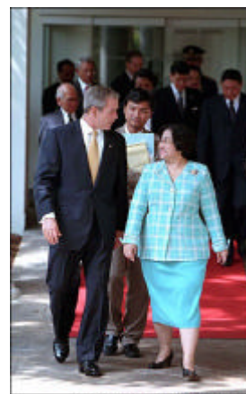
President Bush and Indonesian President Megawati Sukarnoputri , White House Sept. 19.

Megawati Sukarnoputri , President of Indonesia, 19 September 2001