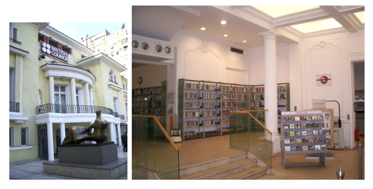
British Council Cairo, Egypt – complete with Henry Moore sculpture; entrance to library portion of the building, including latest pop CDs to draw in local youths.