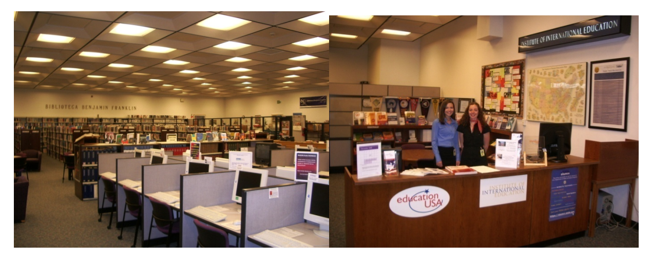
View of the landmark Ben Franklin Library in Mexico City before opening hours and of the Library's Education USA section which counsels students interested in university study in the United States.