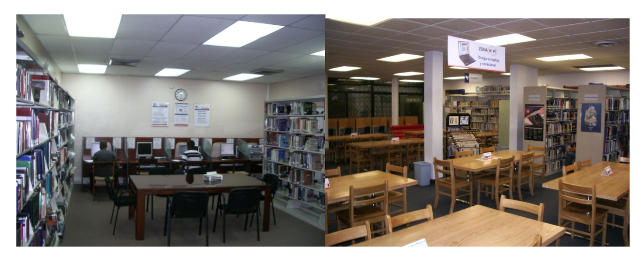
On the left, Embassy Santo Domingo IRC's library of 2,400 titles; on the right, a small portion of Santo Domingo's Bi-national Center's 13,000 titles.

An excellent example of low-cost, high impact Public Diplomacy is the Public Affairs Section's partnership with the national Museum of Natural History. Using a service provided by NASA and for less than $200 a year, the Embassy provides a "ViewSpace" exhibit which offers museum visitors a constant stream of recent and historic images from American space missions and from satellites such as the Hubble Space Telescope. This demonstration of U.S. technology, scientific education and space exploration is one of the most popular exhibits in the museum.