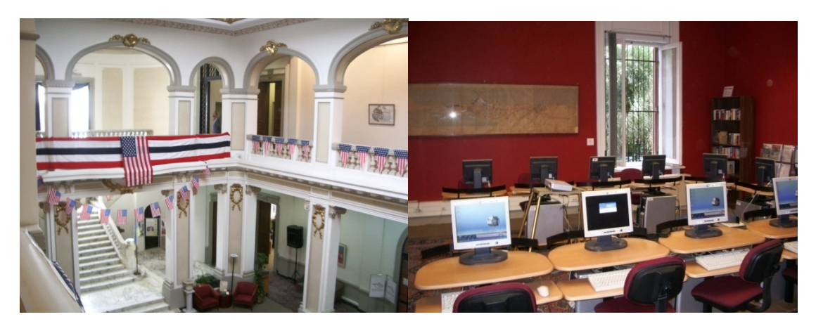
Interior views of the exceptional American Center in Alexandria.

Embassy Cairo's IRC is housed inside our well-guarded Embassy which is part of a diplomatic enclave that is blocked off to vehicular traffic. Walk-ins are welcome during the Embassy workweek Sunday thru Thursday 10 am -4 pm, with late closing at 7 pm on Mondays and Wednesdays. The IRC is well stocked with books on the United States and has an extensive audio and visual library for use on site but acknowledges that its location on the compound serves as deterrence to attracting more visitors. Data provided by the Department of State notes that the American Center in Alexandria, a city of some 4 million, receives on average 1,600 visitors a month while Cairo – a city of at least twice that size – receives less than an 1,000. Embassy officials who recognize the need to provide a more accessible outreach program have begun to look at various properties just outside the compound but still within the enclave that provide both appropriate space and security.