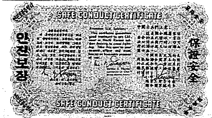
The Ridgway Banknote Leaflet

General Ridgway was appointed commander of all the United Nations forces in Korea on April 11, 1951. One of the most important surrender leaflets printed during Ridgway's tenure was a safe conduct pass altered to