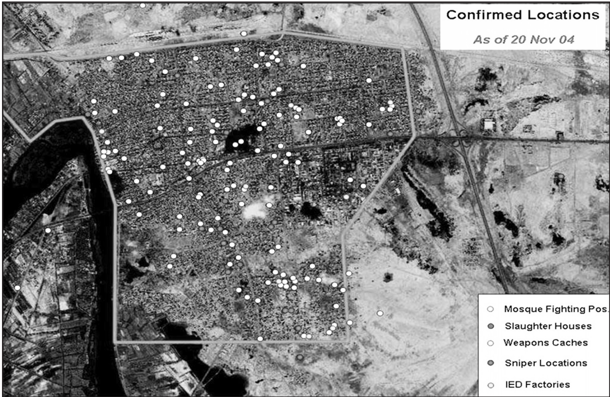
Figure 1. Operation Al-Fajr—Fallujah, insurgent activities map.