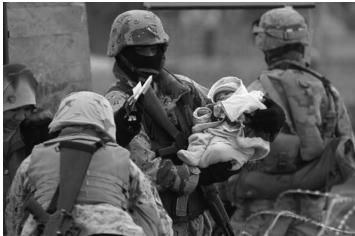
Iraqi soldiers help carry a baby through a checkpoint during the January 2005 elections.

In reality, these two vignettes (Al-Fajr and the embassy attack) are clear examples of how we can