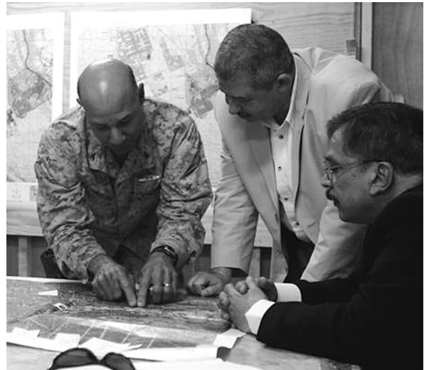
MNC-I and Iraqi government officials discuss security plans associated with the January 2005 elections.

The Green Cell had matured over the 8 years since the Division XXI AWE, and, although its formal objective for 1st Cav's BCTP Warfighter was to drive IO, it spent little time in the 5 disciplines of our doctrinal IO. It did, however, spend very important time in helping Division Headquarters prepare for the perception of a war it might face in Iraq—regretfully by being reactive instead of proactive.