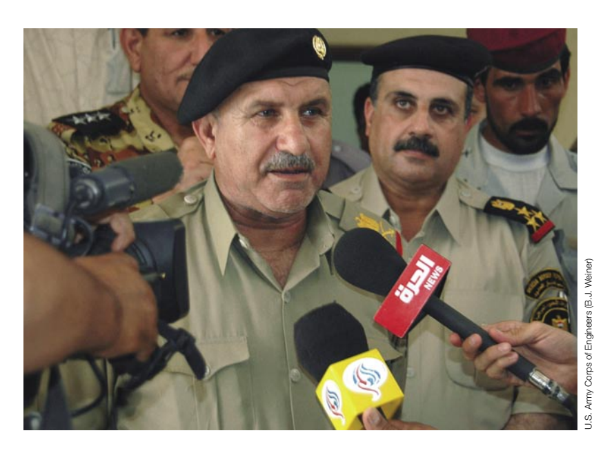
Iraqi general speaking to media at opening of border patrol fort in Al Zaid

Tactically, important indicators are individual or unit desertions, defections, surrenders, abandonment of equipment, civilian compliance or noncompliance, local open-source print, radio, and television coverage, Friday prayers, influential imams' statements, fatwas, meetings, attendance at established local, regional, or provincial coordination committees, polling, recruitment and retention figures in military/security forces (such as the National Guard, police, Facilities Protection Service, border police, and army), attacks on coalition forces and civilians, level of intelligence reported to coalition forces or hotlines, intercepts, paramilitary cooperation, reestablishment of a secure environment, school attendance or closings, civilian compliance with interim government directives, Internet traffic, willingness of students and others to engage in discussions and participate in focus groups, telephone call-in data, reports from USAID and its British equivalent, the Department for International Development, as well as other nongovernmental organizations, willingness to be hired for coalition-led infrastructure enhancement projects, focus groups, surveys of elites, open-source photography, and graffiti.