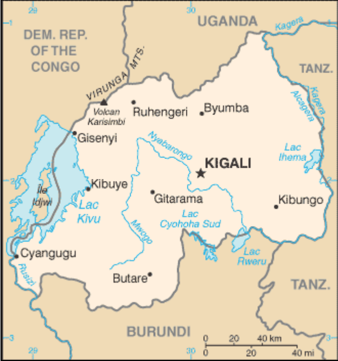
Figure 2: Map of Rwanda