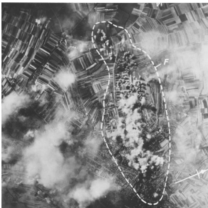
(Above) A city burns. Ninety percent of the Japanese city of Toyama is in flames after an attack by B-29s on 2 August 1945. (Left) Schweinfurt erupts. Military, industrial, and residential areas are the subject of a dense pattern of bombs. Yet, the bombing of Baghdad was described as "one of the heaviest aerial bombardments in history" in a post-Gulf War New York Times dispatch.