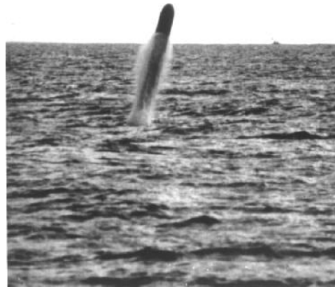
A Tomahawk leaves the sea on its way to a target. Thirty-nine Tomahawks attacked targets in Baghdad in the first 24 hours.

In terms of historic achievement, there is no question that stealth demonstrated that individual targets in defended airspace could be found amidst dense urban sprawl