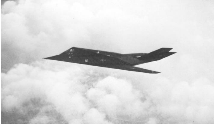
A success? After the first three days, F-117s could report back that they had successfully delivered a total of six bombs on capital leadership targets, 16 bombs overall in Baghdad.

think it was sequestered for high-threat areas where other planes might be more vulnerable or where collateral damage concerns precluded less accurate platforms. Stealth's focus "mostly against targets in the heavily defended areas of downtown Baghdad" is even cited in the Defense Department's Conduct of the Persian Gulf War as its decisive contribution. 15